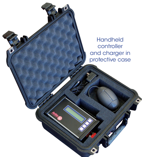
Handheld controller and charger in protective case